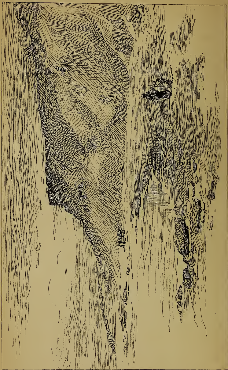
THE CLIFFS AT BLOCK ISLAND.